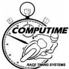
Clerk of Course - Brendan Ferrari

Computime Race Timing Systems Pty Ltd © 1996-2008 Licensed to Computime Race Timing Systems