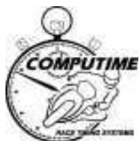
Clerk of Course - Andrew Winter

Computime Race Timing Systems Pty Ltd © 1996-2008 Licensed to Computime Race Timing Systems